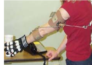
Fig. 2. the BPO. A zipper sewn into the palmar side of the glove facilitates donning.

flexion pull on the cables, thereby forcing the fingers to extend. This single control moves all fingers simultaneously in a manner akin to that of control of the prehensor in arm prostheses. Alternatively, the cable can be run to a handle held by the unimpaired hand; extension of the unimpaired arm extends the fingers on the impaired side. In either manner, the user controls the amount of assistance provided to finger extension. The cable housing over the MCP and PIP joints also serves to prevent hyperextension of these joints.