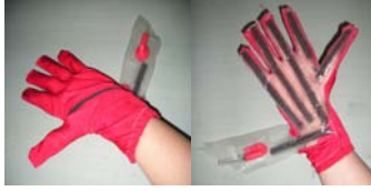
Fig. 3: Picture of the glove that contains the bladder on the palm of the hand. The electro-goniometers are attached with Velcro to the volar surface of the glove over the PIP and MCP joints.

joint angles are compared with the desired trajectories necessary for opening the hand sufficiently to grasp the object.